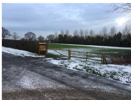
Established access to the proposed site