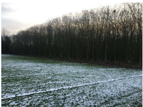
View looking West towards woodland