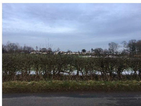
The park from Gale Lane